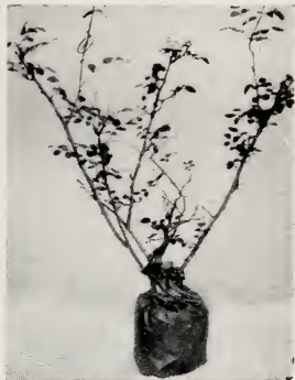
2-year old plants, soil on roots, wrapped ready for shipment.

CULTURAL INSTRUCTIONS —Plant deep and firmly. Spade the ground to a depth of about fifteen inches. Ordinary garden soil will grow our roses beautifully. Water thoroughly when setting out. Don't keep plants wet after the first good watering. Don't cover too early. Wait until the ground is frozen a little and then heap soil up around the plants to the extent of 4 to 6 inches. Take some of the soil off gradually in early spring. Roses like ours need no petting and coddling. They grow and bloom.